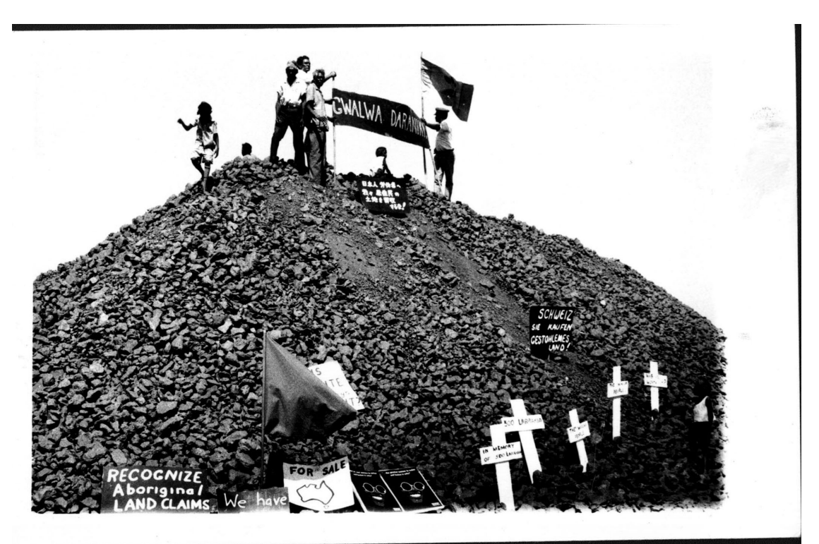
Plate 1: (Above) On top of the iron ore stockpile, Darwin wharf, 14 July 1972.